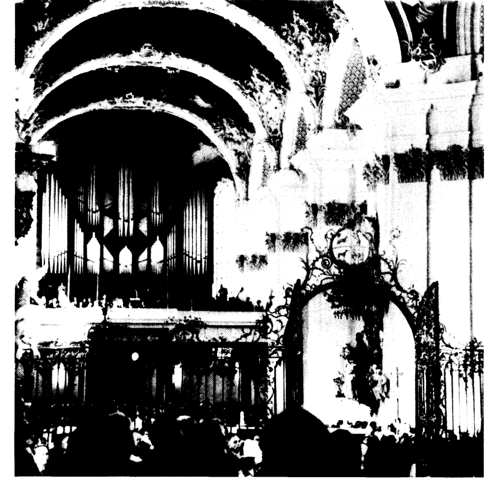
St. Gall, interior with organ.