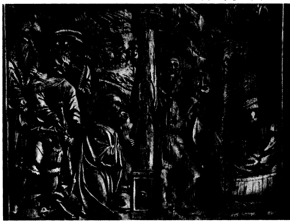
HANSHELL: HINTS ON CELEBRATING MASS