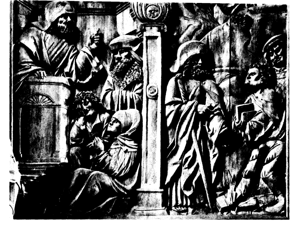
Reliefs portraying the life of St. James