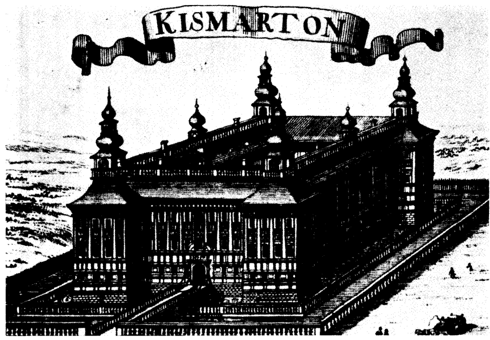
The Esterházy Palace at Eisenstadt