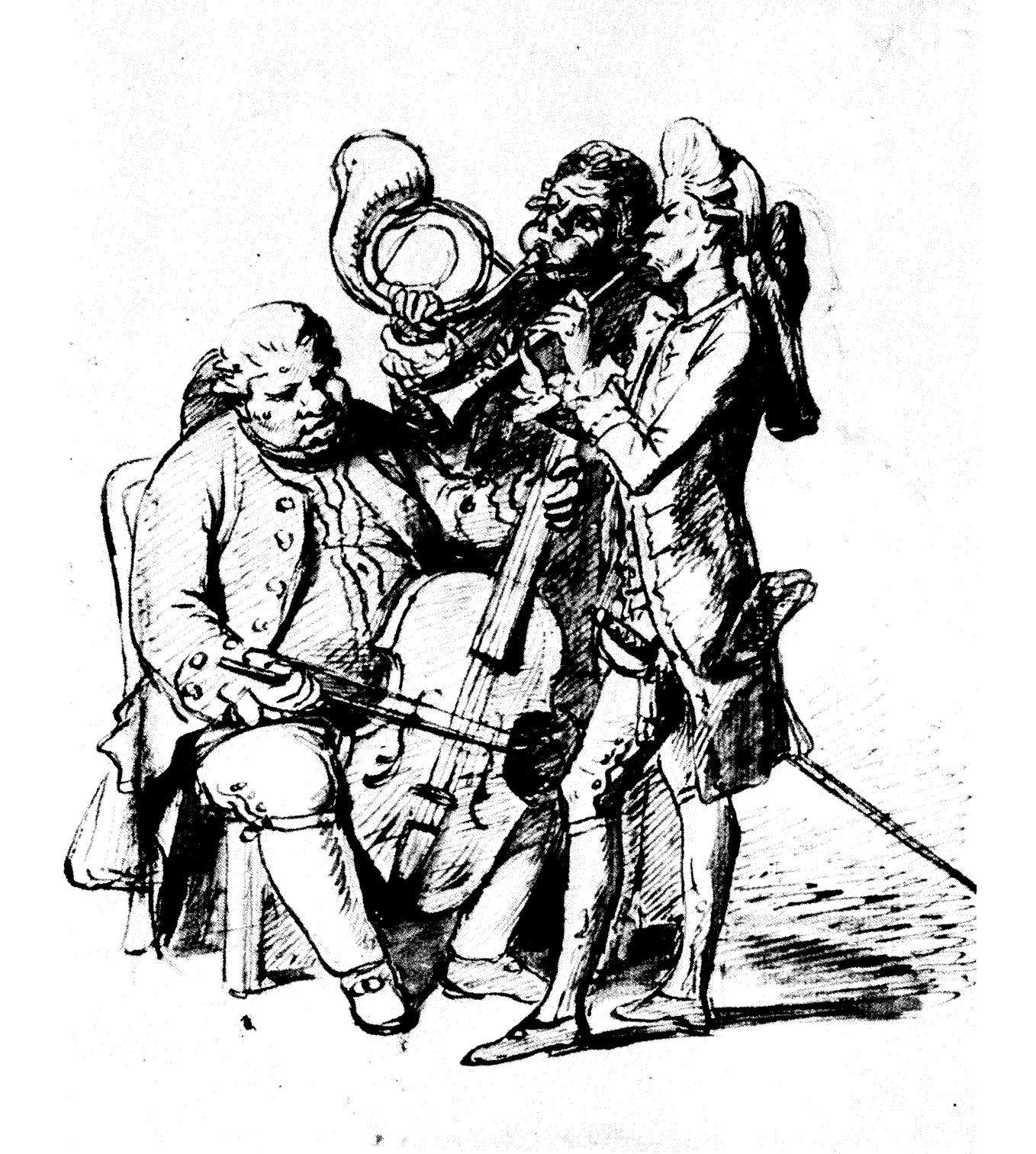
Three Musicians of Haydn's Time (by Nathaniel Dance)