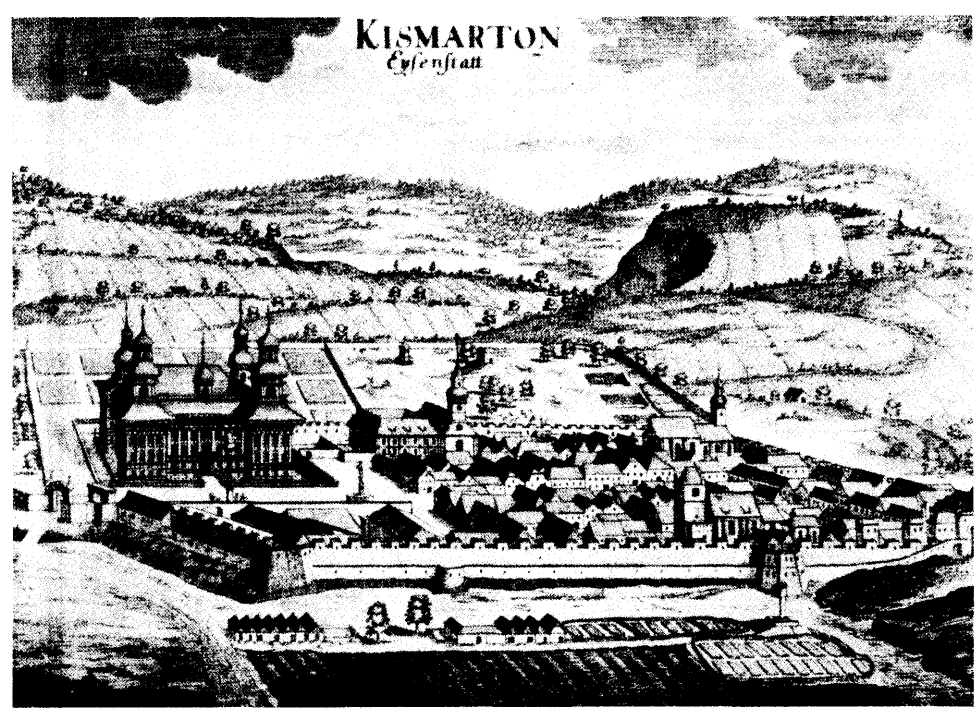
The Town of Eisenstadt