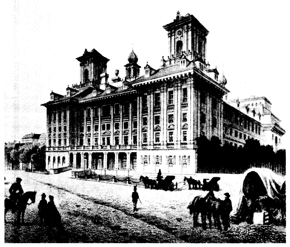
The Esterházy Palace at Eisenstadt (by C. Rohrich)