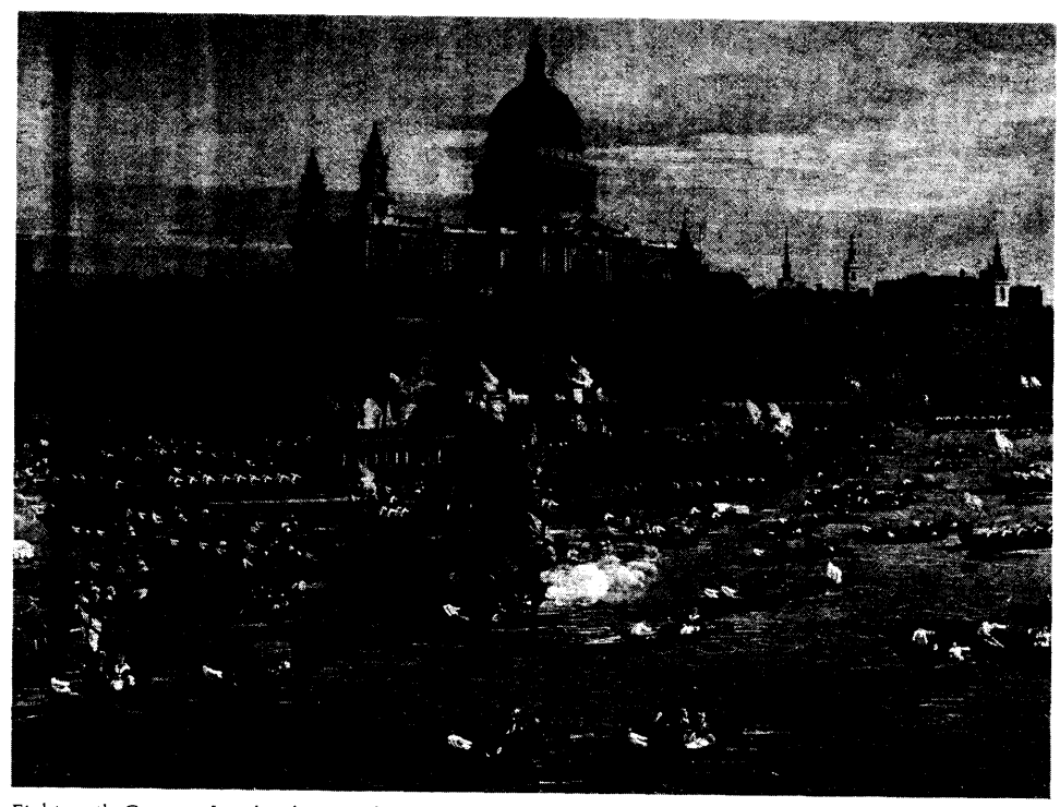
Eighteenth Century London by Canabetto