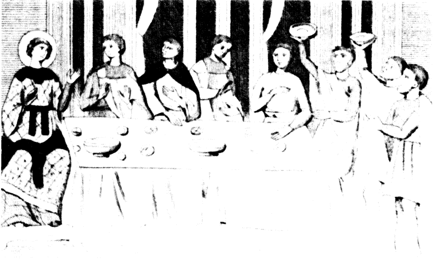
Banquet with Valerian