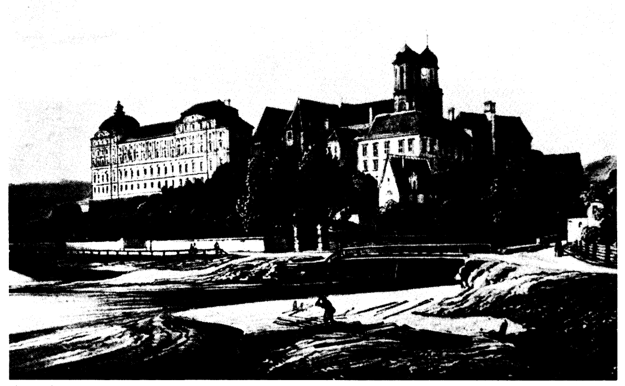
Klosterneuberg, near Vienna, Austria