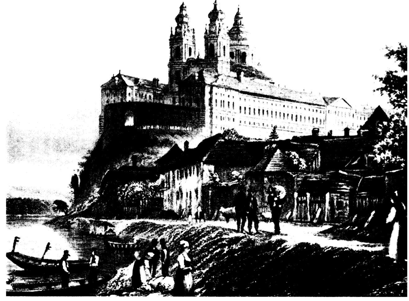
Melk Abbey on the Danube, Austria