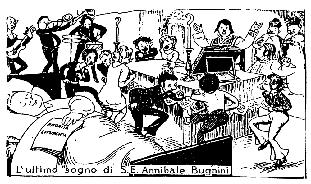
Last Dream of Archbishop Bugnini