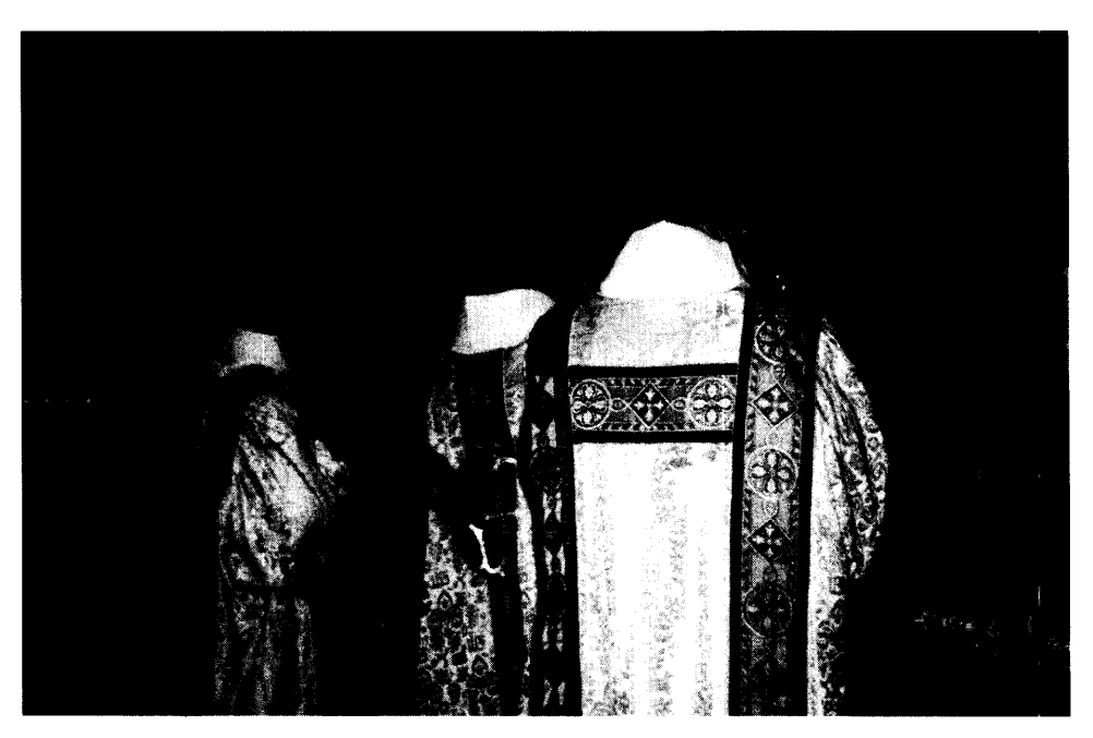
Society of St. John, Holy Week 2001 (Shohola, PA)