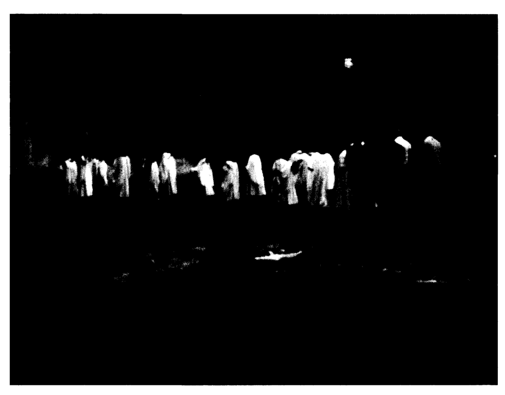
Society of St. John, Holy Week 2001, Holy Thursday Procession