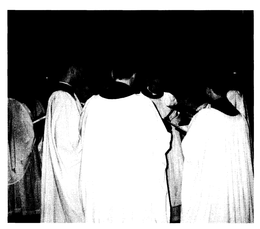
Society of St. John, Holy Week 2001 (Shohola, PA)