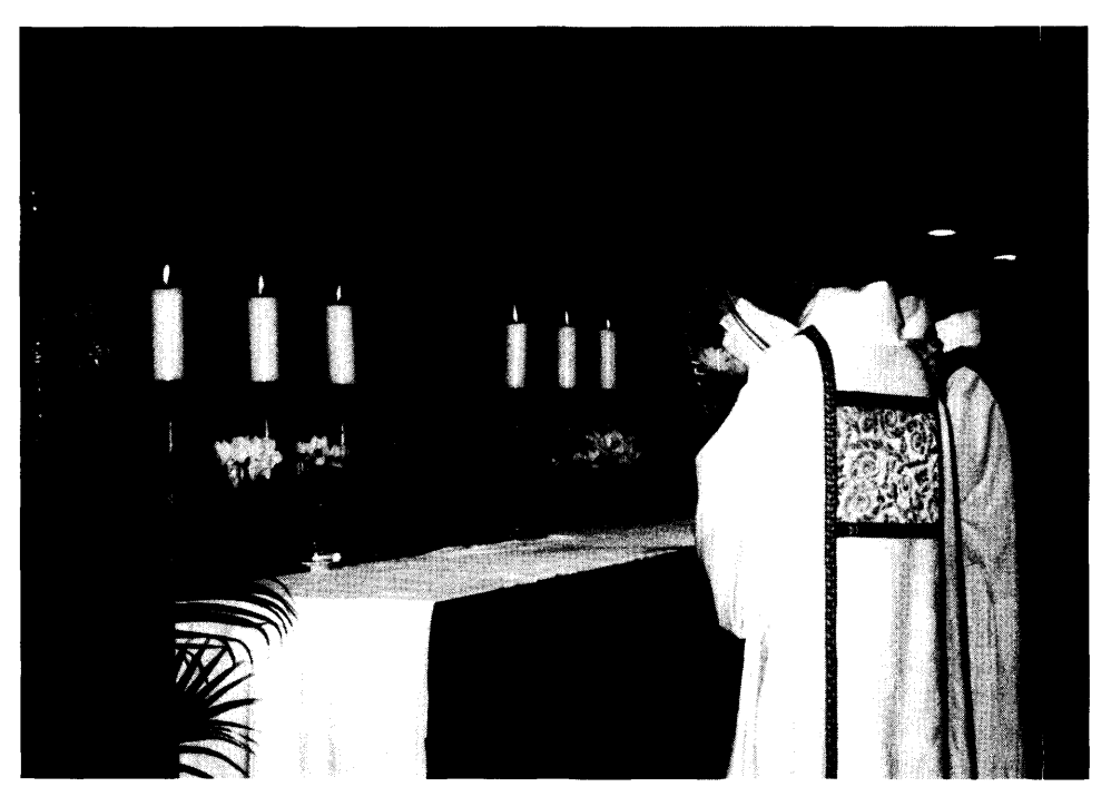
Society of St. John, Holy Week 2001 (Shohola, PA)