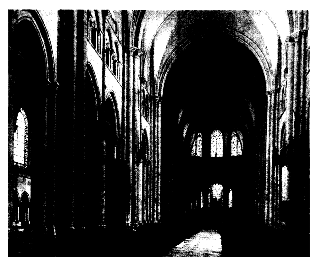
Nave, looking east. Cathedral, Sens, France.