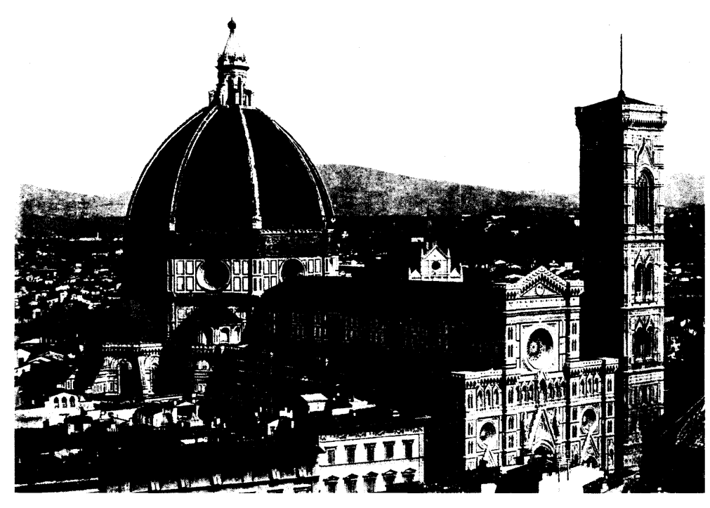
Cathedral and Campanile, Florence, Italy.