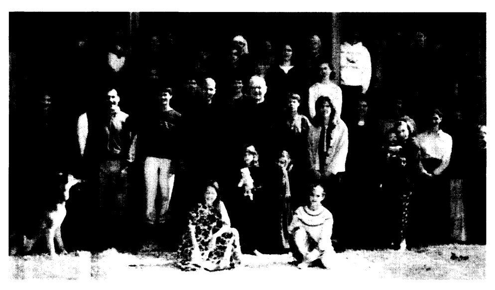
Second Annual Gregorian Chant Workshop (October 11 - 13), Clear Creek, Oklahoma