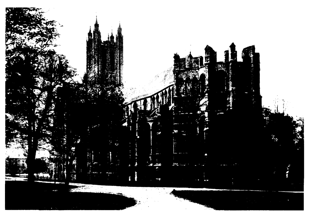
View from southeast. Cathedral, Canterbury, England.