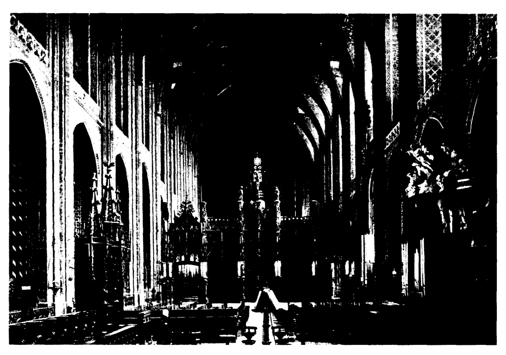
Choir and Nave. Cathedral, Albi Gothic (Fortress Church). 1282—1345. Jubé, Flamboyant. 1512