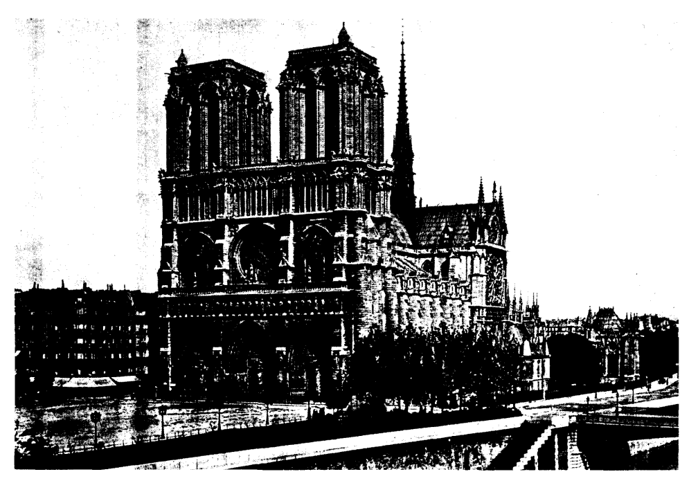
View from Southwest. Cathedral (Notre Dame), Paris.